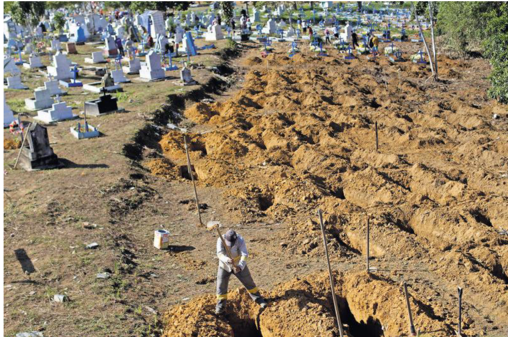
A shaken nation Graves being prepared in Manaus, Brazil, for inmates who died during a prison riot. Over six days, 93 inmates were killed at four prisons. PAGE 3