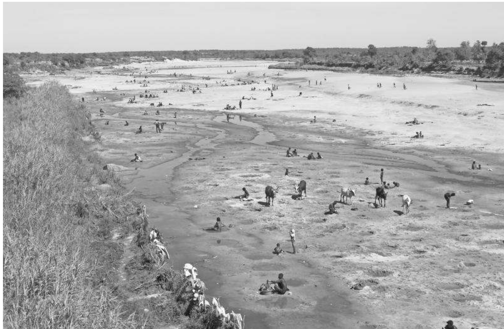
Many rivers and wells have dried up in southern Madagascar, forcing people to buy water that is trucked in.