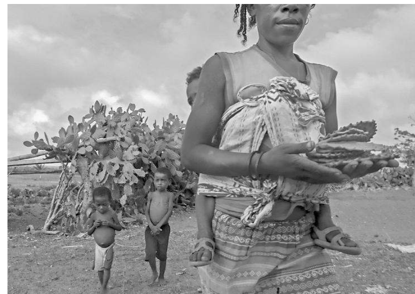
Though cactus pads provide little nutrition, Fidine must use them as the one meal of the day for her two nephews, standing behind her, and her own two children.

"If children are stunted and do not receive the nutrition and attention in these first 1,000 days, it is very difficult to catch back up," noted Joshua Poole,