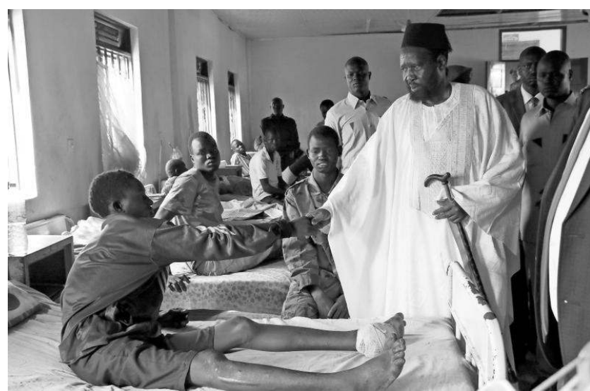
President Salva Kiir of South Sudan visiting Sudan People's Liberation Army soldiers at the military hospital in the capital city of Juba last month.

The S.P.L.A., according to African Union data, was made up of 200,000 soldiers and 45,000 veterans but lacked a roster of its men. With 700 generals, it had a higher ratio of generals to soldiers of any army in the world. These AK-47-toting soldiers and their commanders had not won the war, did not constitute a coherent force and had no more than a slim civilian base. Yet they took the driver's seat at independence.