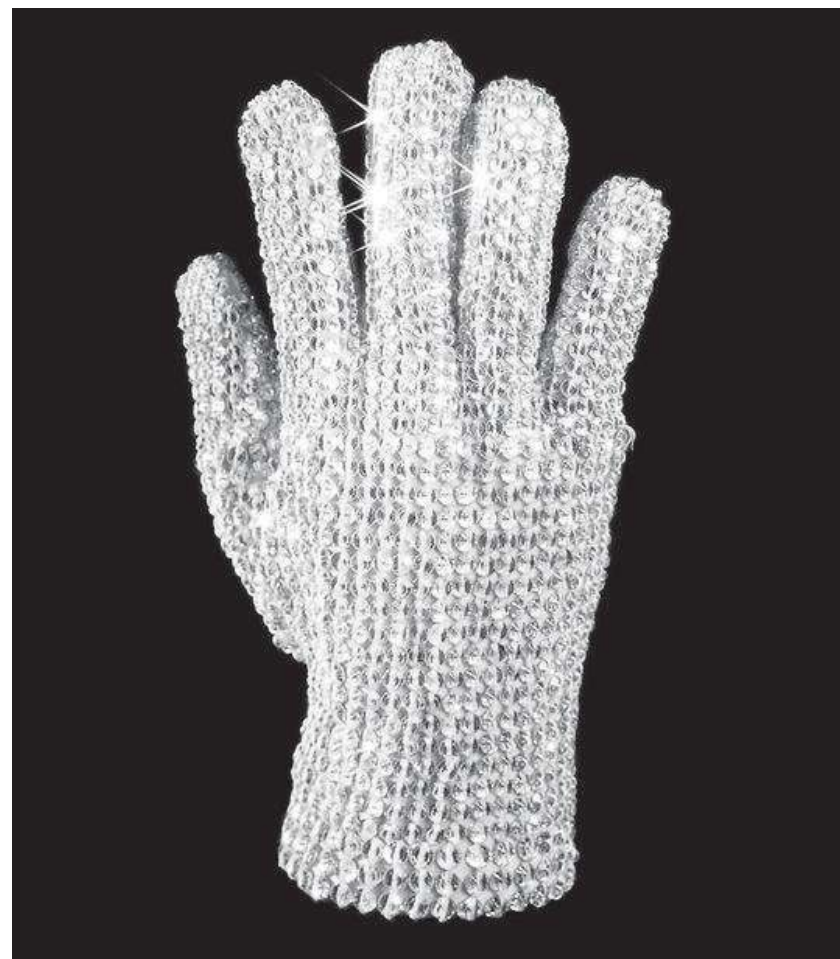
A glove worn by Michael Jackson, similar to this one, is among the assets the Kleptocracy Asset Recovery Initiative tried to seize from Equatorial Guinea’s ruling family.