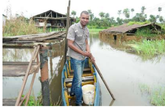
Plate 1: Houses constructed on raised platforms above flood level in the study area.

The construction of flood-resilient houses is a prime example of how the Kalabari mitigate risks associated with coastal flooding. I observed that most houses along riverbanks are built on wood or concrete platforms as a means of raising the houses above flood levels (Plate 1).