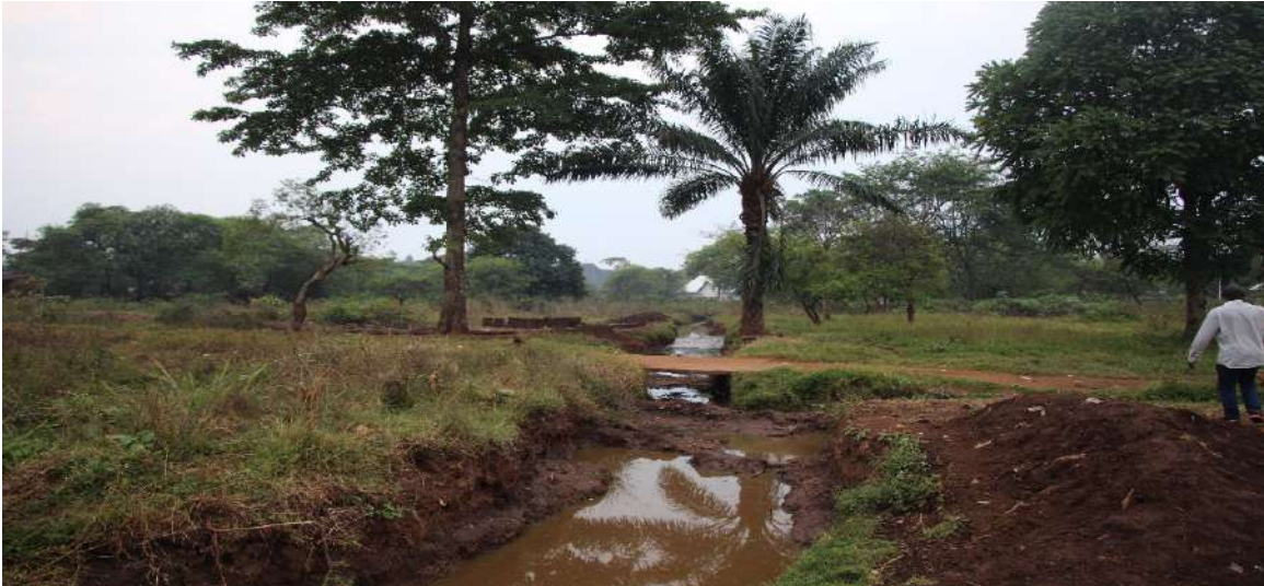
Photo 1: Emergency canal built by the population in LUVUNGI to evacuate the water that causes flooding in the neighbourhoods