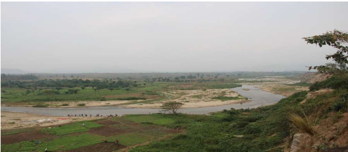
Photo 2. View of the RUVUBU River in LUVUNGI