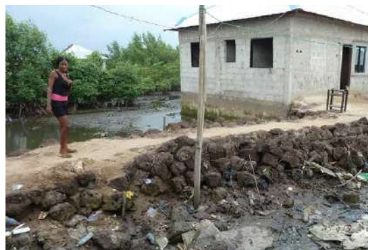
Plate 2: Local shoreline protection with chicoco mud (lika) in the study area.

To mitigate the impacts of coastal flooding and erosion, communities in the study area rely on Indigenous shoreline protection that uses local resources and technology. For example, they construct shoreline walls with chicoco mud, locally known as lika , and mangrove wood known as angala to serve as defense against rising waters and erosion (Plate 2). In some cases, sandbags are also used to protect the riverbanks from being inundated by flood waters.