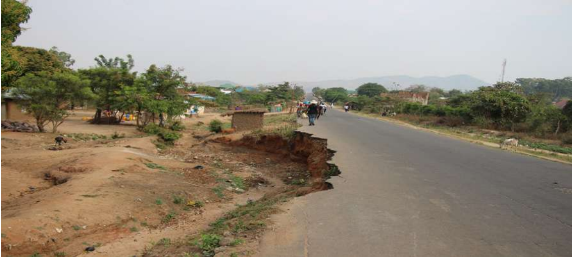
Photo 3. National road N°5 in SANGE in a state of disrepair due to erosion